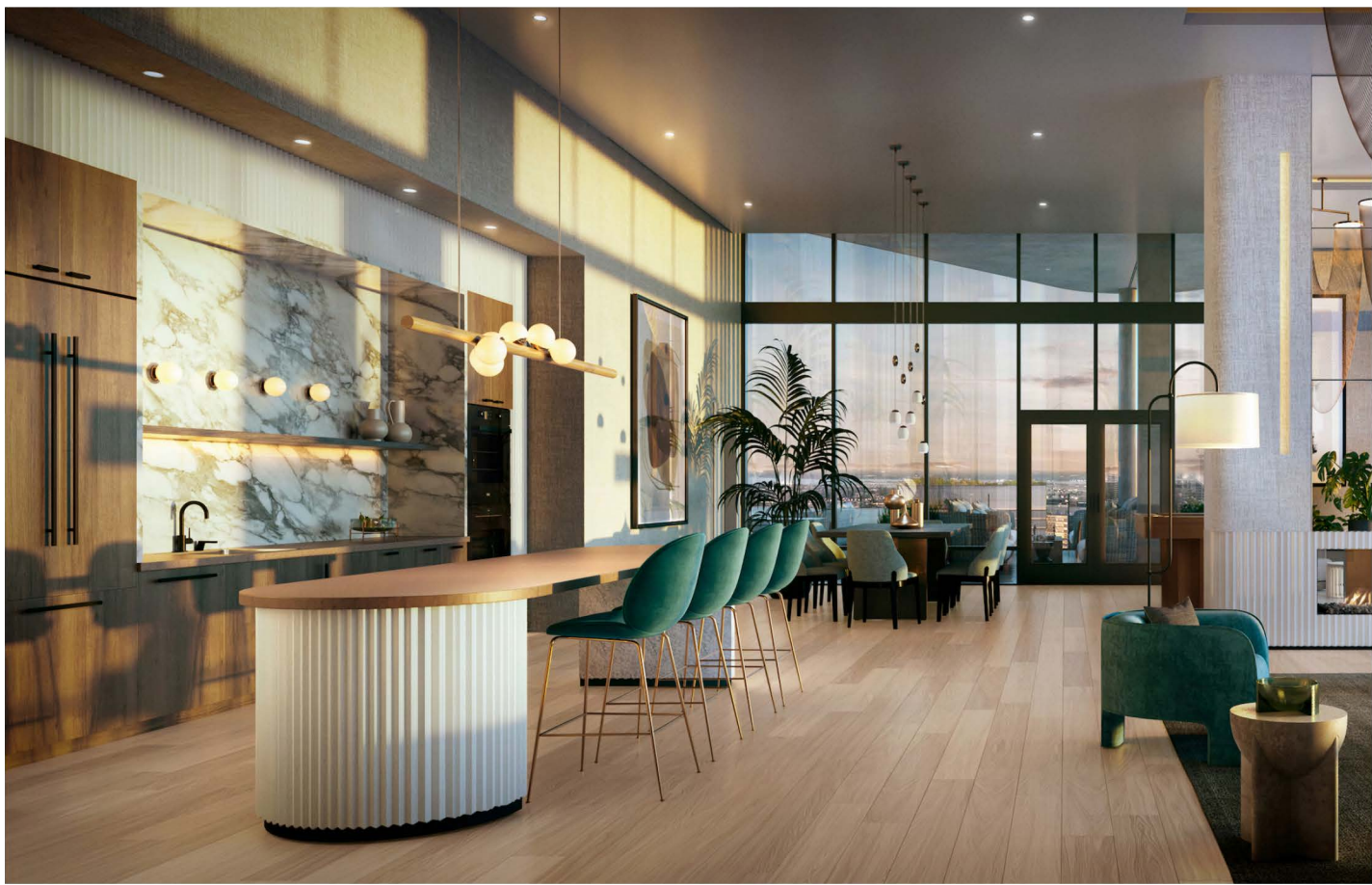
The 40th-floor Sky Lounge includes an entertainment kitchen with a communal bar, billiards and a double-sided fireplace, set against sweeping views of the San Diego skyline.

Step beyond the sleek lobby and you are immediately transported into an exclusive world designed for the senses, where a gaming lounge, a craft room, a pet spa and even a bike repair and tune-up station showcase the property's unparalleled attention to detail. At the heart of this elevated lifestyle is the roughly 15,000-square-foot Pool Terrace, a sun-drenched oasis that feels miles away from the bustling streets below. Here, shimmering azure waters invite you for a morning swim, while the gentle coastal breeze rustles through manicured palms. Residents can recline in private cabanas or gather with friends around elegant fire pits as the sun dips below the horizon.